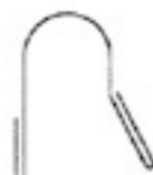
G 2115 "U" SPRING