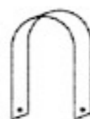
G 2113 "U" BAND